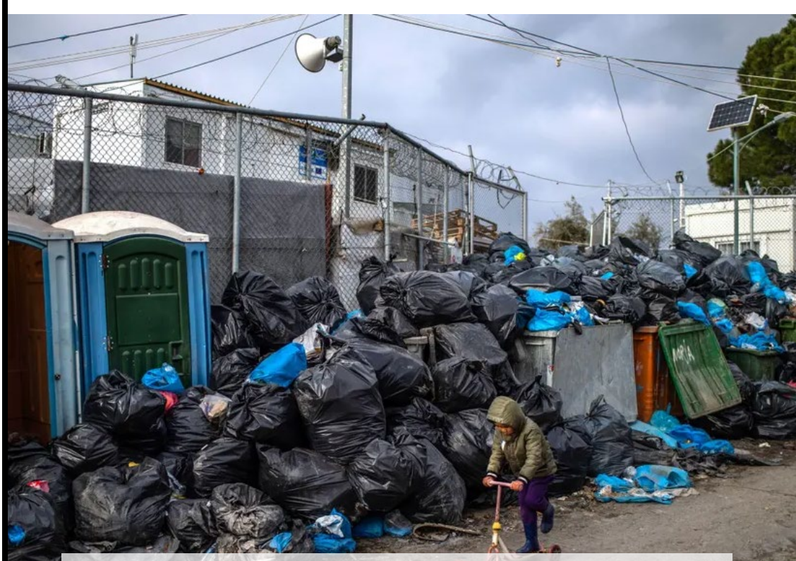
Moria camp on Lesbos has grown from a population of 5,000 in July 2019 to around 20,000.